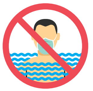
No mask in the water