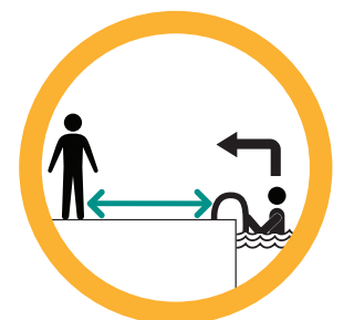
Adopt safe behaviours at focal points