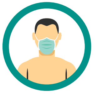
Wear a mask out of the water